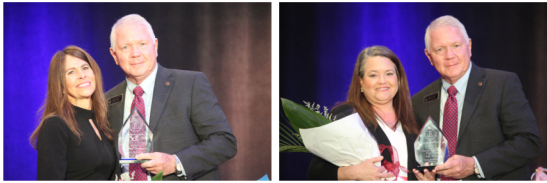
Teacher of the Year